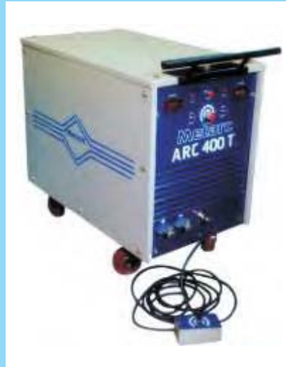
THYRISTOR ARC POWER SOURCES