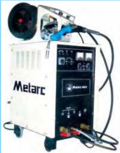
THYRISTOR MIG MACHINE