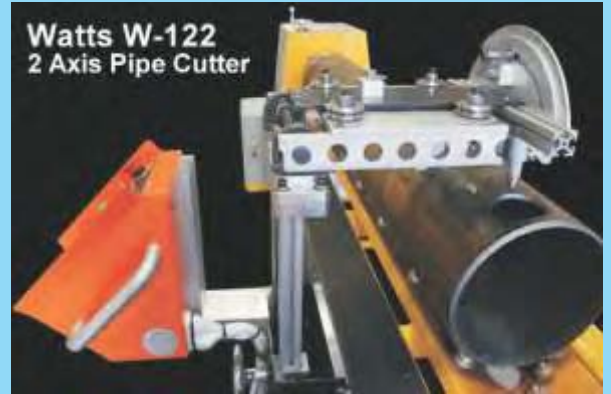
Watts W-122 2 Axis Pipe Cutter