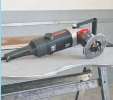
PLATE BEVELING MACHINE