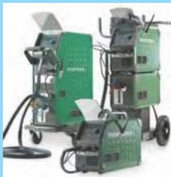
SYNERGIC TIG MACHINE